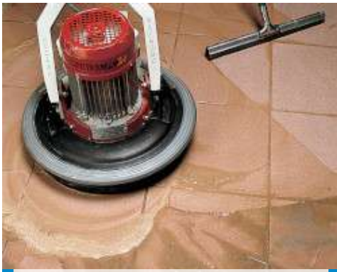
Finishing a porcelain tiled floor with single-brushed power float or rubber squeegee