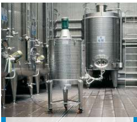
An example of a grouted wine cellar floor