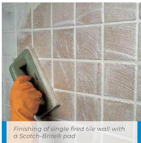
Finishing of single fired tile wall with a Scotch-Brite® pad