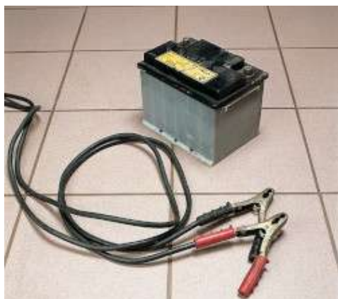
An example of a grouted battery room