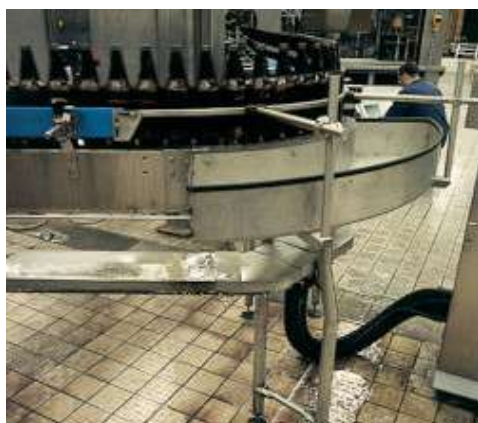
An example of a grouted brewery floor