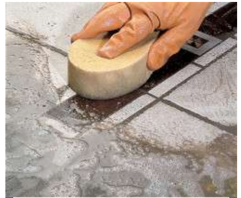
Finishing a ceramic tile floor with wood inlays with a sponge