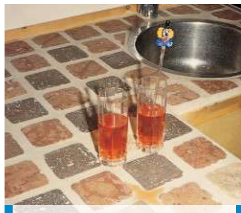
An example of a bonded and grouted kitchen worktop