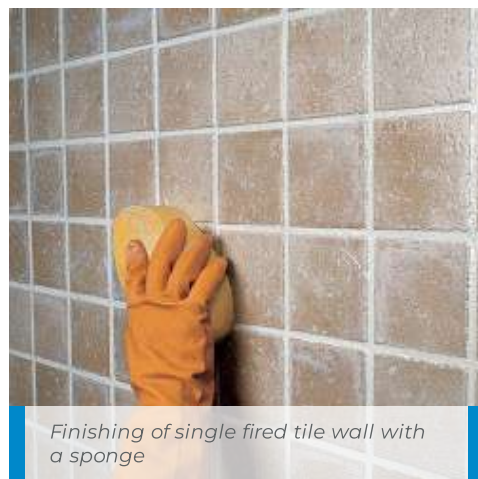
Finishing of single fired tile wall with a sponge