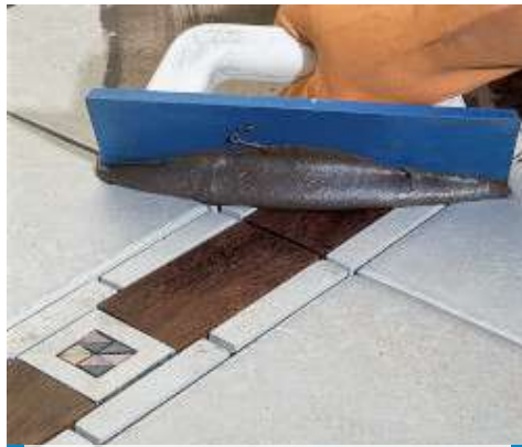
Grouting a ceramic tile floor with wood inlays with a trowel