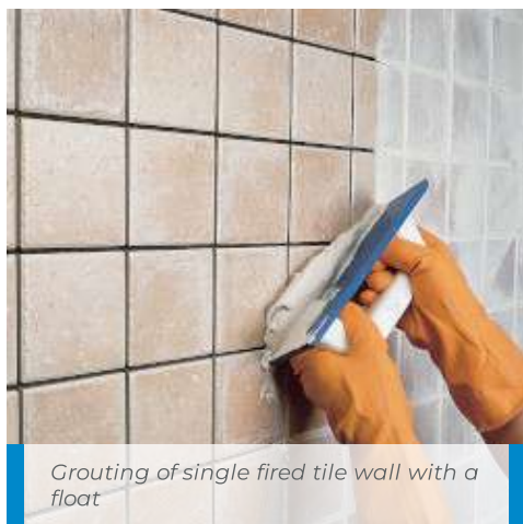
Grouting of single fired tile wall with a float

For the use of products from the UltraCare range, please refer to the relative Technical Data Sheets.