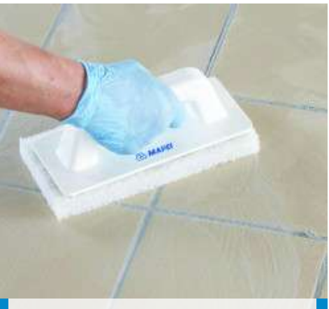
Cleaning joints with Scotch-Brite®